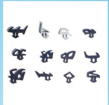
UPVC Frame Gaskets