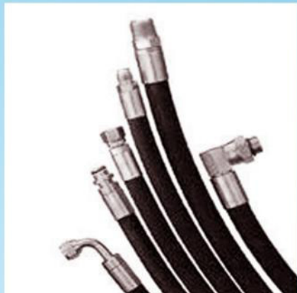
Low Pressure Hoses