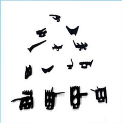
Architectural Frame Gasket