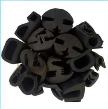
Automobile Rubber Profiles