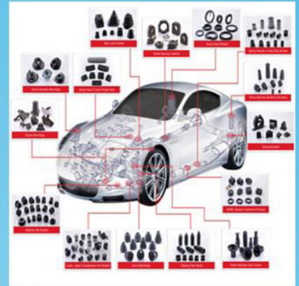
Automobile Moulded Components